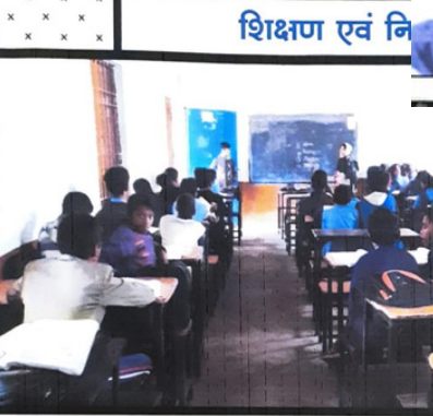
टीम बनाना एवं मदद करना