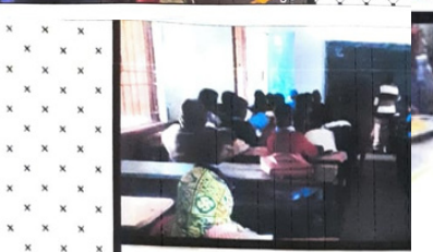
शिक्षण एवं निरीक्षण