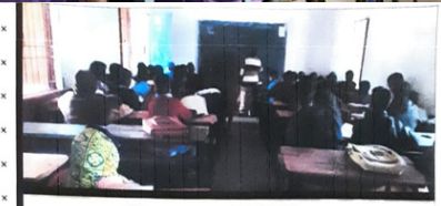
शिक्षण एवं निरीक्षण