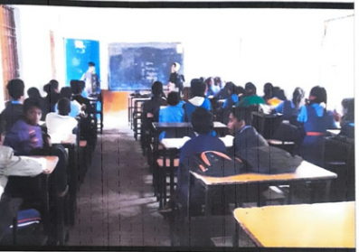
टीम बनाना एवं मदद करना